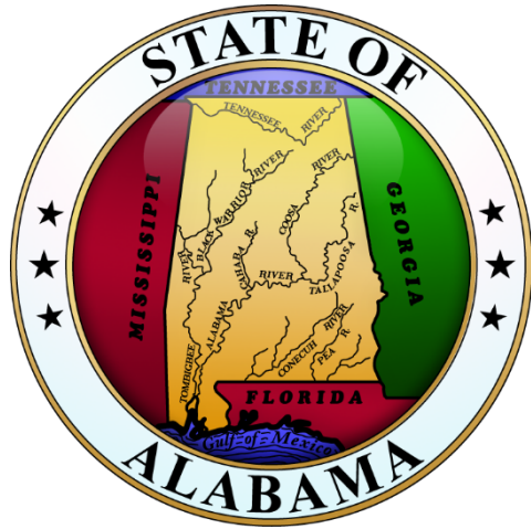
Kay Ivey Governor